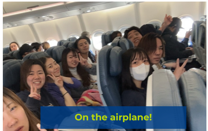
On the airplane!