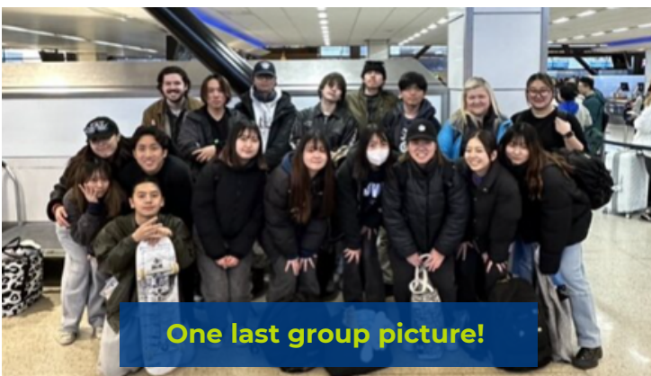
One last group picture!