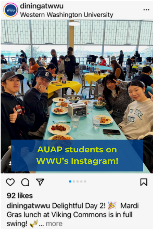
AUAP students on WWU's Instagram!

Activities and Events: AUAP students were active the for the last few weeks of the cycle, participating in many activities with friends and with local families. The students really enjoyed going to a prom held at WWU. They learned about the traditions surrounding prom in Experience class and had fun dancing with friends! They also enjoyed Bellingham's beautiful sunsets from Boulevard Park!