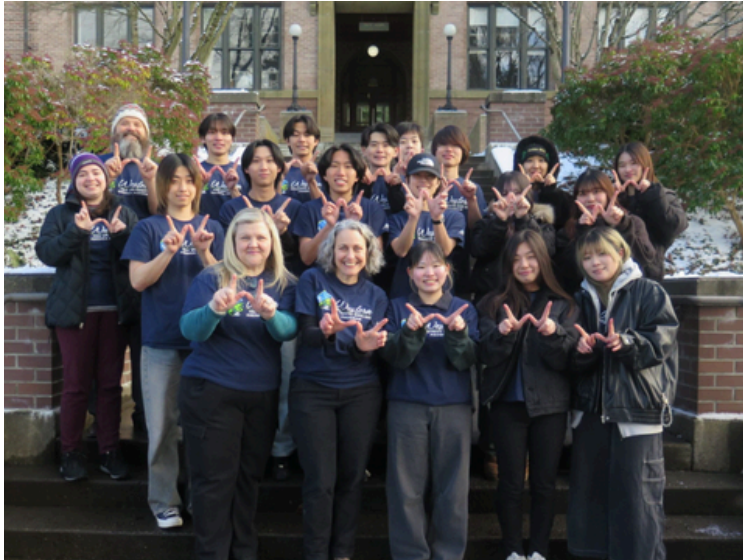
Group photo in front of Old Main on a chilly, snowy day!

Closing Ceremony: Our Closing Ceremony was a time to celebrate the accomplishments our students made during their 5-months at WWU. Several awards were given out including Outstanding Student, Most Improved, and Most Inspiring. Two students were also given Perfect Attendance awards! Two students gave speeches about how their AUAP experience had changed them and they brought tears to many eyes! The celebration wrapped up with a dessert reception and lots of pictures with friends, IEP classmates, roommates, classroom volunteers and more!