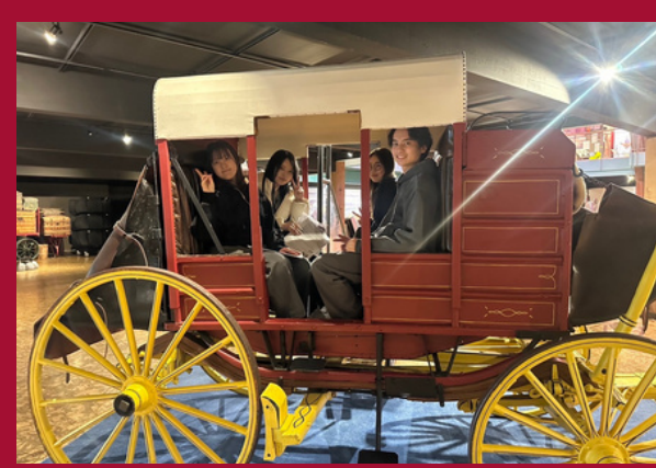
"This photo is my first time riding a horse-drawn carriage. I was so excited."