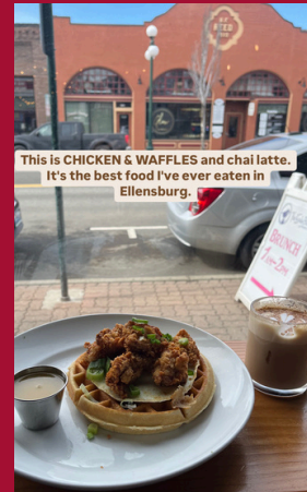
This is CHICKEN & WAFFLES and chai latte. It's the best food I've ever eaten in Ellensburg.