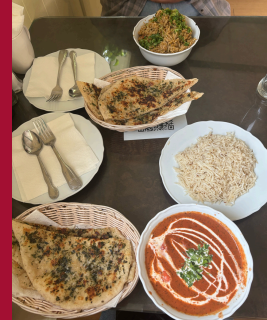
"This photo's restaurant is Taste of India. I like Indian curry better than Japanese curry."