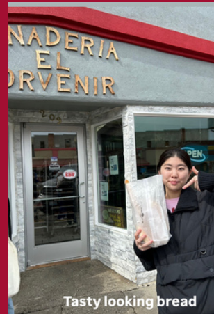
Tasty looking bread