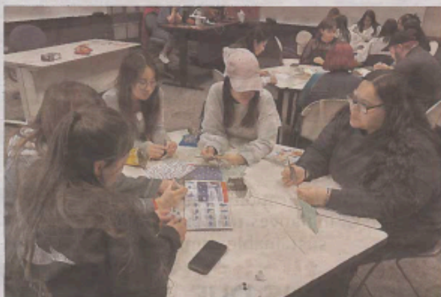
Origami night at AUAP Friends Club.

The AUAP Friends Club will continue to host interactive events throughout the quarter on Thursdays where all students alike have the opportunity to get to know our AUAP Wildcats.